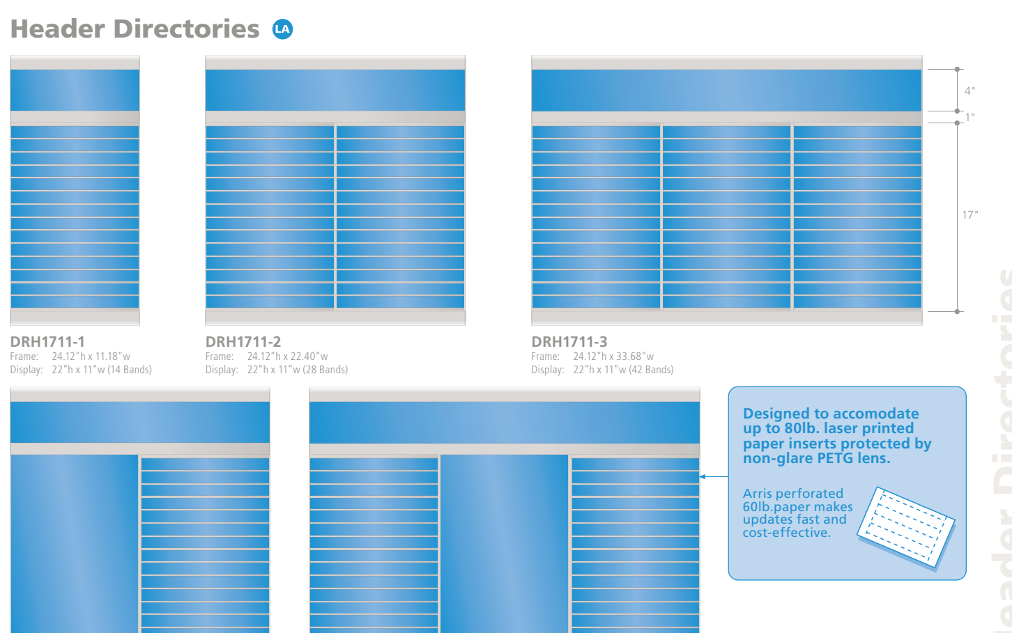
DRH1711-4 Frame: 24.12"h x 22.40"w Display: 22"h x 11"w (14 Bands)