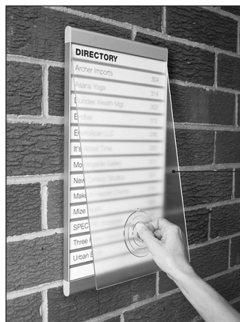
Clear Lens - Insert into top of frame, then slide down.